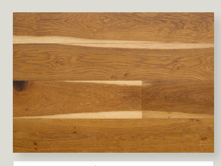
ROURE MONTGARRI ref. 380.12 RV